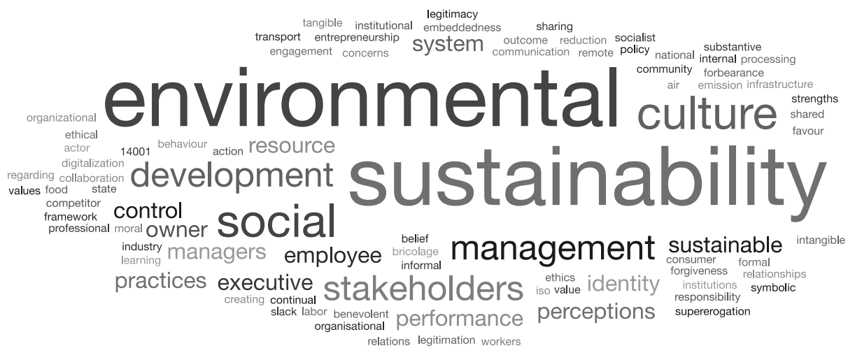
Figure 2 Word cloud - keywords used by the authors of analyzed studies

Figure 1 presents the number of published journal articles per annum. The studies considered in the analysis were published from 2009 to 2022. Figure 2 provides an overview of the keywords used by the authors of each study. The larger the text, the greater the number of occurrences of a given term in the analyzed text.